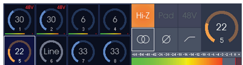
Aurora (n) front panel preamplifier screen.