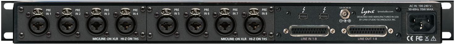
Aurora (n) PRE 1608 rear panel.